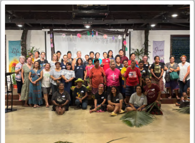
Ladies Bible Fellowship

City water, which usually supplies our house and the church property, was not working from July-November due to repairs on a nearby tank. Thankfully, when we returned, I was able to get a pump and connect water from our rain catchment to the house and church bathrooms and eventually to the rest of the property. Although there were some days that we nearly ran out of water, with the Lord's providing of rain, the large church roofs poured water into the tanks which was then pumped through the pipes to our house and the property. We have never thought about or prayed for rain so much in all our lives! Thankfully, the city water tank is repaired now.