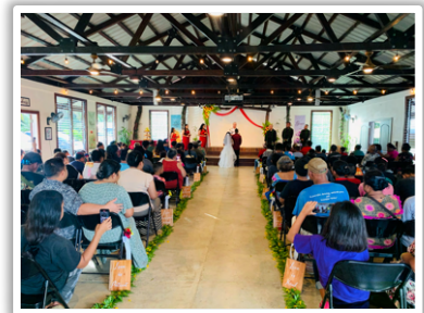
Christian marriage is a great testimony