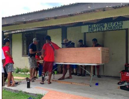
Men help build casket and ladies prepare food for the funeral