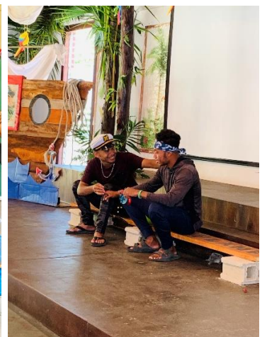
Sherman helped teach 7-9 yr olds: