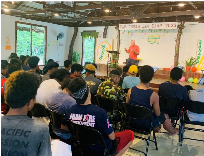
Evening preaching service

Although the weather for the week of our teen camp was not ideal, it didn't stop these teens from having a blast! We were thankful for our new, big building that was an all-purpose room for the week. Teen camp days are full with two meals served, a split session and an evening service, devotionals in the camp booklet, lots of games, cheering, skits, and an intense Bible memory competition. We registered more than 80 teens and many of them made decisions to follow the Lord during the week. For a video of the teens singing at teen camp go to https://vimeo.com/854113825