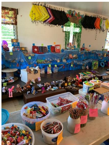
The VBS Store

We were so thankful for all those who sent packages to us with prizes and clothing for our "store." As you may know, the kids and teens earn points by attending, bringing visitors, completing their devotionals, and memorizing verses. They then can use their points in the "store" where they can get prizes, candy, school supplies, jewelry, and the most loved items . . . clothes! To give you an idea of how it works, attending is 100 points and each memory verse is worth 100 points. We make the clothing worth 100 points each so that they can get lots of clothes! It makes us so happy to see them walk away with huge piles of clothing! Perhaps you will see your shirt on an islander in a picture or in real life if you come to visit!