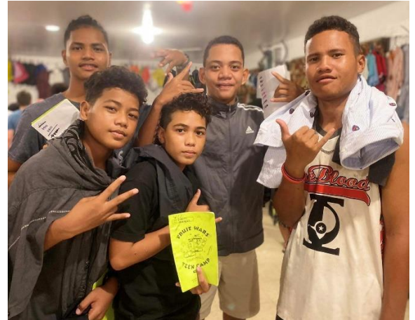
Some Ulithian boys who joined our teen camp