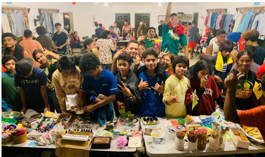
Happy customers at the Teen Camp Store...they especially love jewelry and clothes!