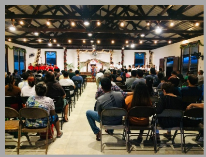
Christmas service at Yap Baptist

https://vimeo.com/538476494 Yap Baptist Church service video