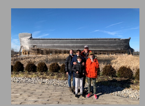
Family trip to the Ark Encounter