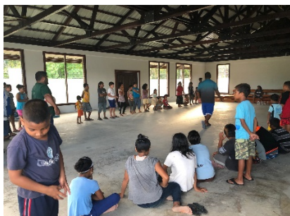
Father's Day Feast