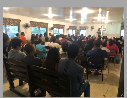
First Sunday back after social distancing

Here is a link to a video walk through of the new building: https://vimeo.com/438024849.