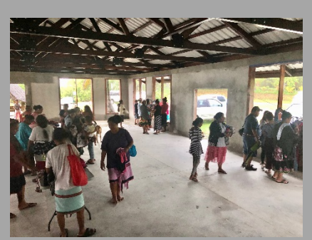
Used clothing gifts for Mother's Day