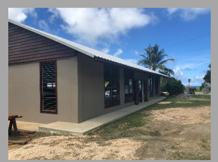
Current progress of the building