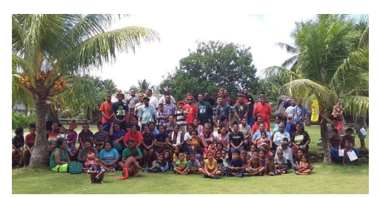
Fais Baptist Church Family