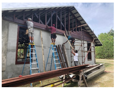
Installing local mahogany siding

Here is a link to a video walk through of the new building: https://vimeo.com/438024849.