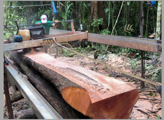
Process for getting more lumber