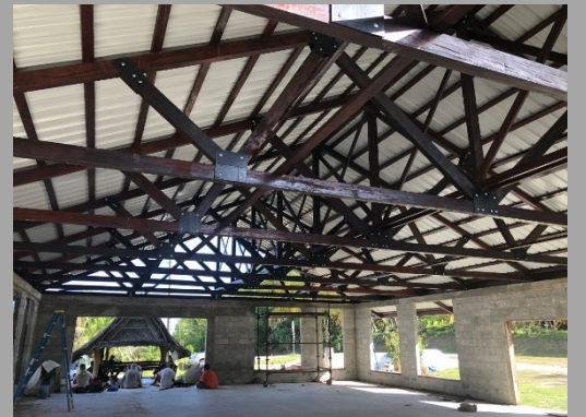
Interior view of exposed beams

We continue to minister to the men in the prison on Sunday afternoons. Our services include preaching, showing Christian movies, and they especially love singing. For the past few weeks, we have been blessed to have a newly released prisoner attending the church services at Yap Baptist. He shared with me that he accepted Christ while in prison. He has shown a desire to follow the Lord, and he helped us as we worked on the roof.