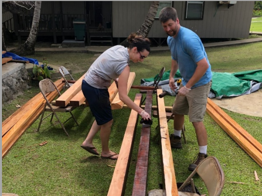
Staining and varnishing 4x6 beams