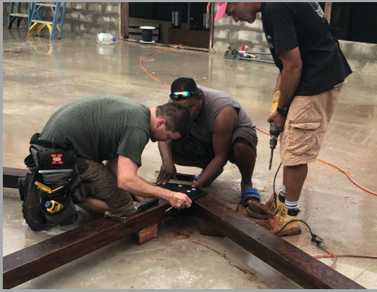
Bolting steel plates to connect the beams