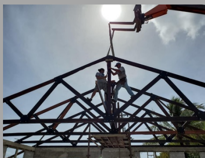
Sky Trek helped to place the trusses