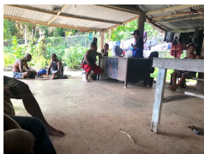
Showing Overcomer to prisoners - Prison Rec room where we meet for Bible study