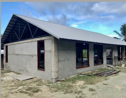
Current progress of the building