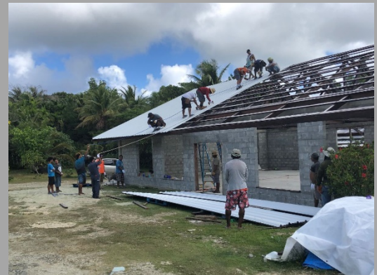
Installing steel roofing panels