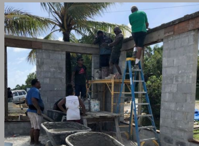
Pouring the Beam in early January