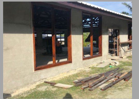
Finished plaster and mahogany window frames ready for louvered glass to be installed