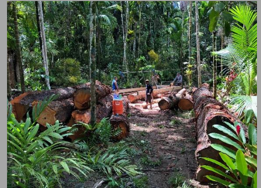
Milling in the jungle