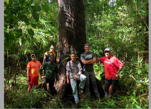
College students help with tree work

If you would be interested in receiving our updates through e-mail, you may contact us at markanddiane@zimmerfamily.org .