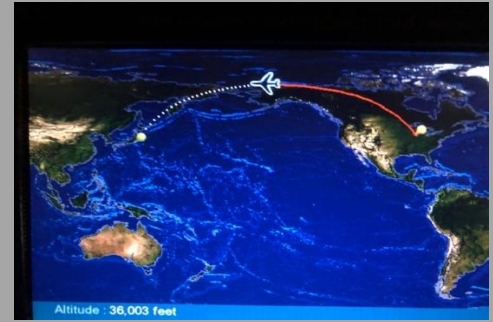
Chicago to Tokyo flight path: 13 hours