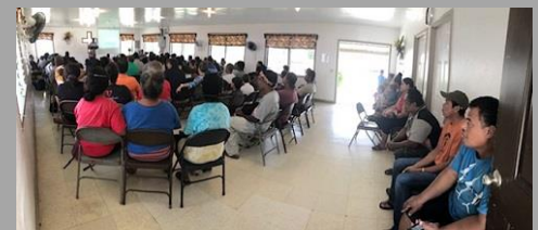
Sunday Morning worship service