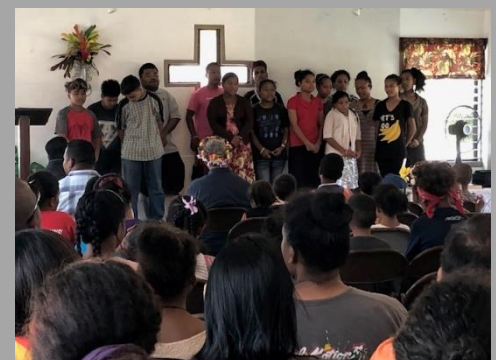
Teens sing special music