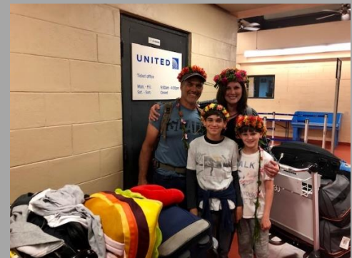
Our new little family arrived safely in Yap