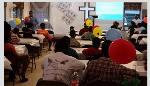
Father/Son outreach in Yap