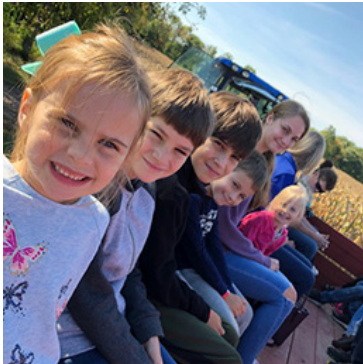
Fun at the pumpkin patch with the Schmidt kids