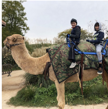
The boys enjoying a camel ride at the incredible Columbus Ohio zoo!