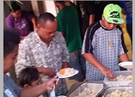
An August father-son fellowship