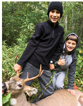
The boys were pretty excited to help track the deer in the woods!