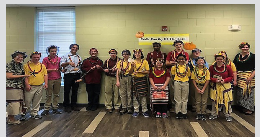
Hidden Treasure students learn about Yap