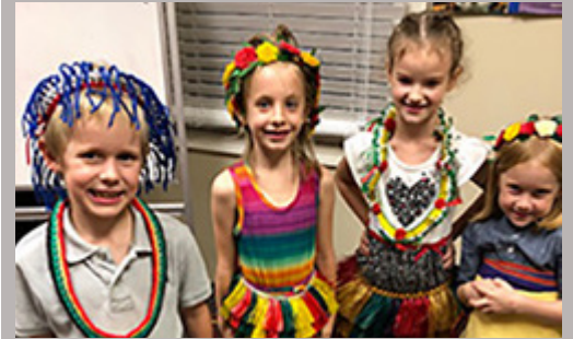
Children enjoyed dressing in Yapese clothing