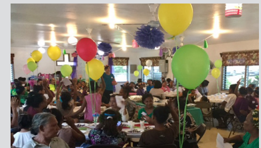
Mothers and daughters enjoying time together