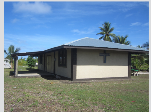
Newly completed Fais Baptist Church