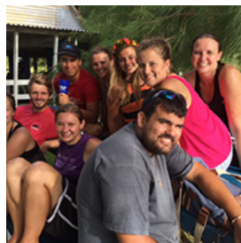
Camp team members