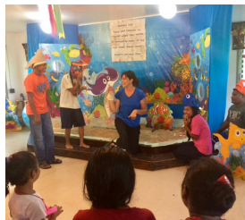
HBBC students in skits