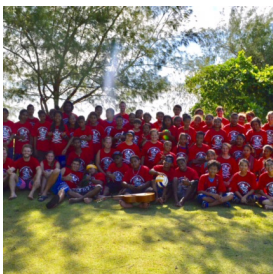
Teen Camp 2017