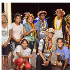
HBBC students at airport