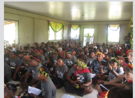
Fais Baptist Church open house service