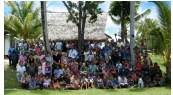
Yap Baptist Church Congregation

The end of May was a bitter sweet time for our family, having to say good-bye to our dear friends in Yap, but being reunited with family and friends in the states. We are back in the states now for our 2nd furlough, and we look forward to seeing many of you in the next few months. We hope to return to Yap sometime in the spring. Please continue to pray for the people in Yap, that many more will come to know our Savior and that the Christians there will be strengthened and encouraged.