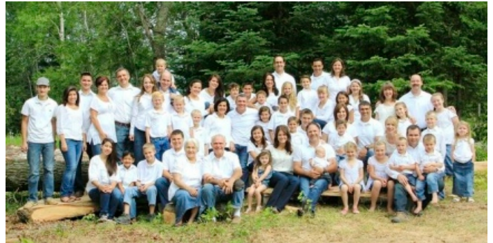
Zimmer Family Reunion in Traverse City, MI

Back in the States our family reunion was very encouraging. We had a fun time reuniting with brothers and sisters, cousins, nephews and nieces, and of course Grandpa and Grandma. We sang around a camp fire each night, played games, went fishing, and of course ate many wonderful meals. We celebrated my mom and dad's 50th wedding anniversary during our time there as well.