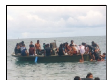
O'Keefe's Island Outing

pulled by my smaller boat, "Old Glory." The teens enjoyed hanging out on our other boat, "Albatross" (pictured here). We may have broken some coast guard rules, but the teens had a blast! (OVER)