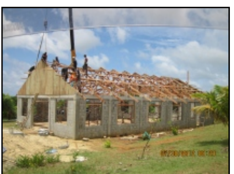
Paul's New Church Building

of the children's programs. Our Thursday night Kid's Night continues to be a highlight during the week for the kids.