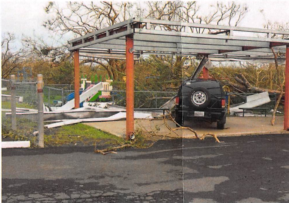
Pick up area for junior High and High school