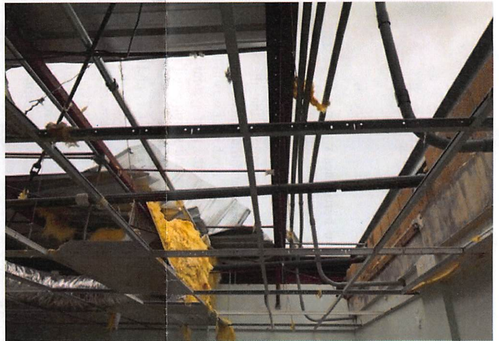
my former office