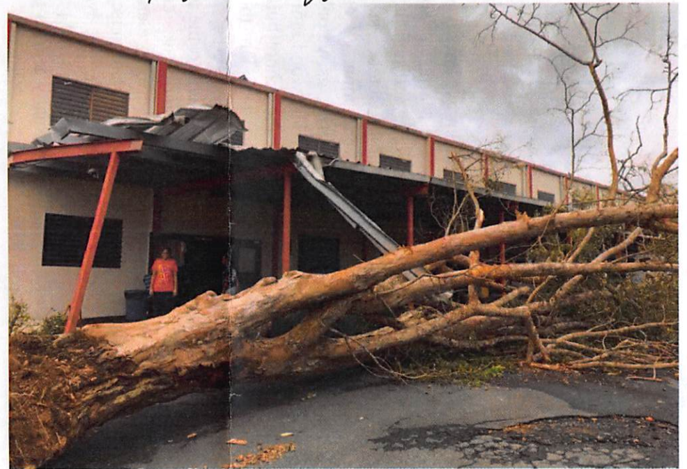
Pick up area for elementary