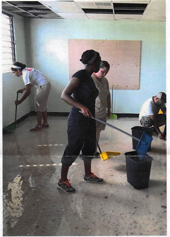
Students and teachers cleaning up.