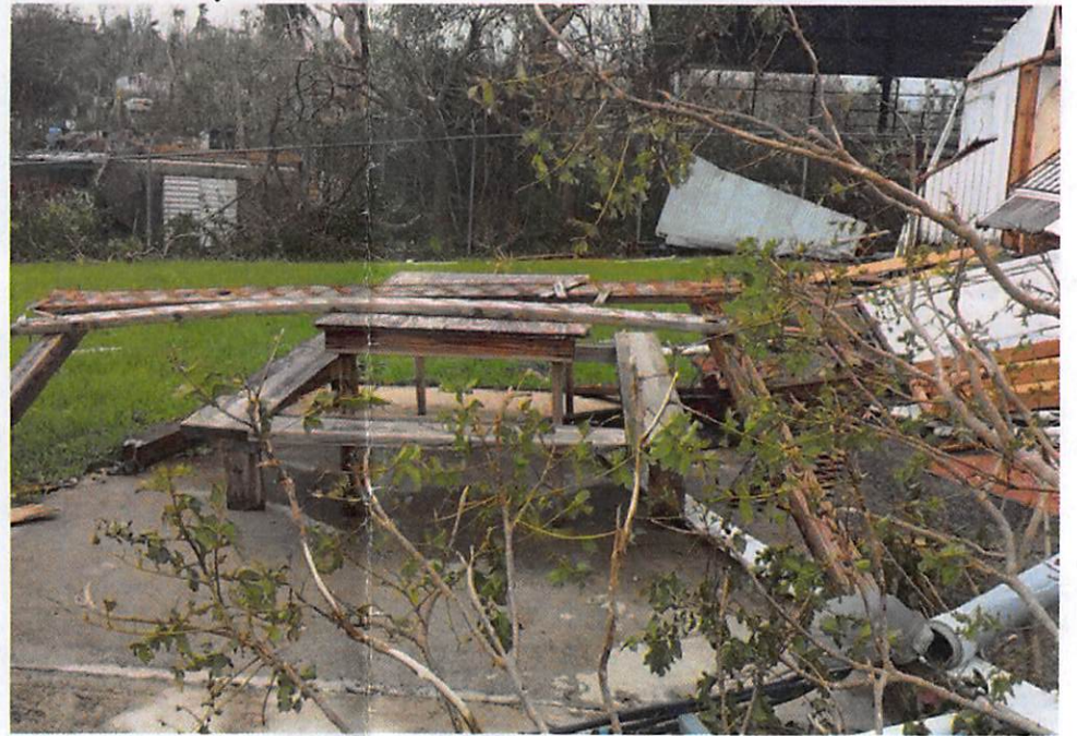
Remains of a gazebo