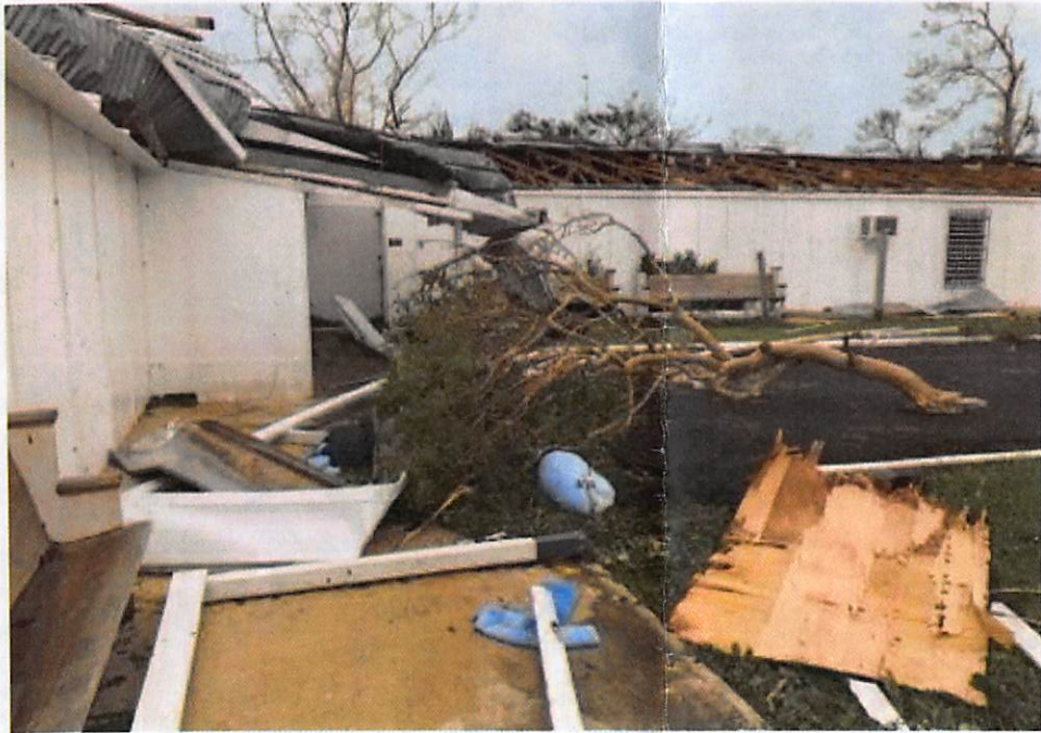
College building and girls dorm