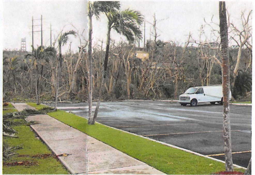
Jungle behind church building