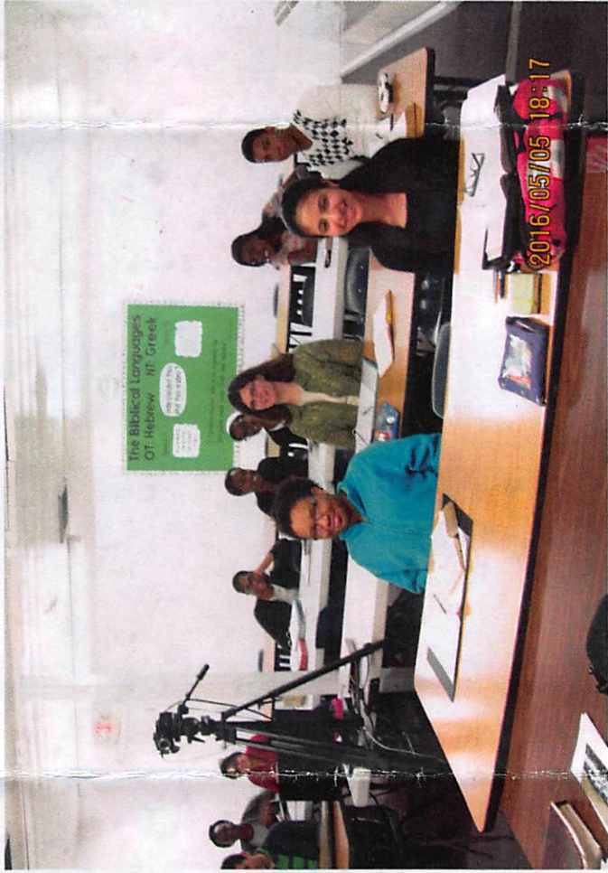
PR Summer School