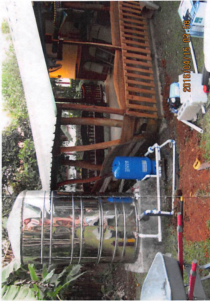
Rain water tank and pump