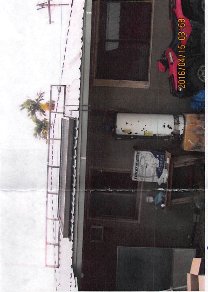
Solar hot water heater