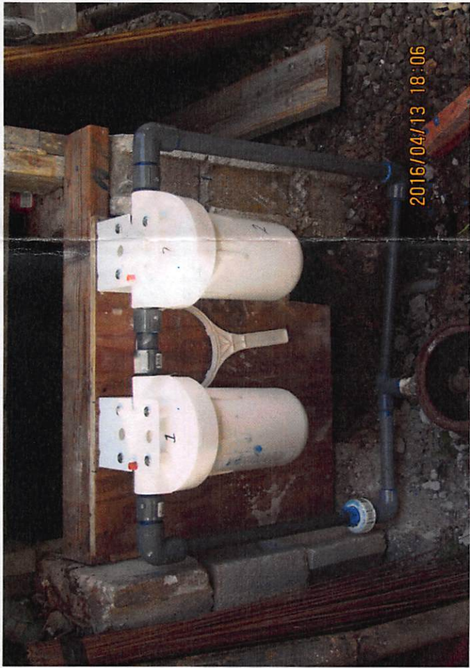
Whole house prefilters