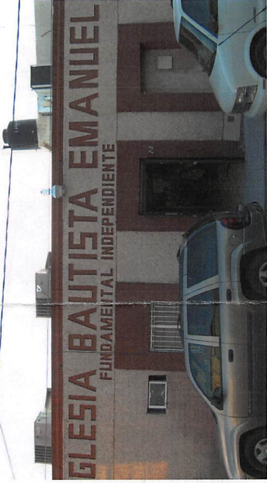
Emanuel Baptist Church