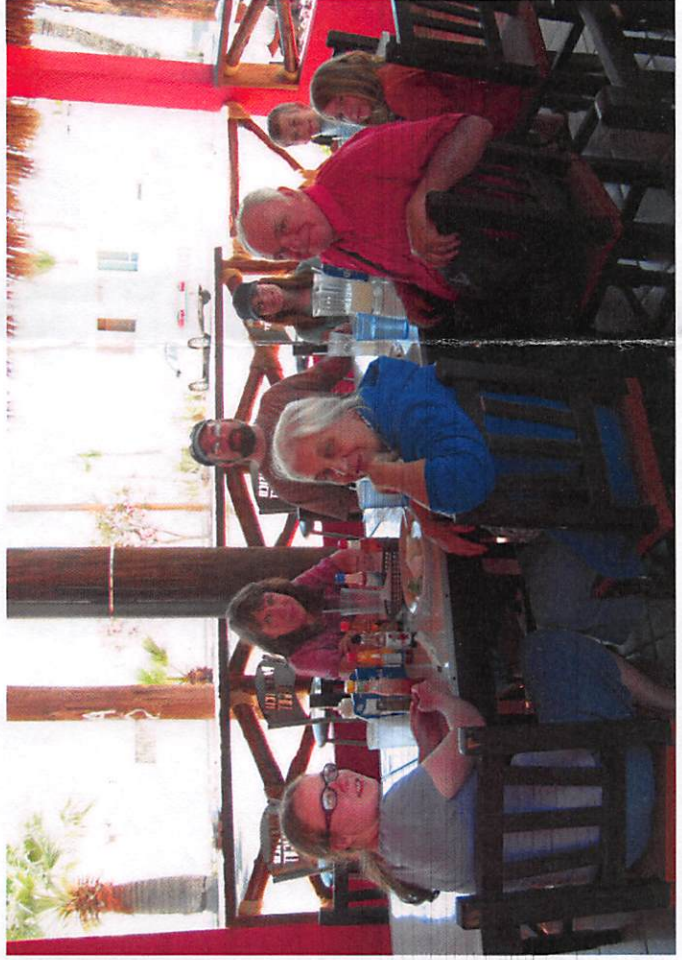
Seafood restaurant at the Inlet of Cortez