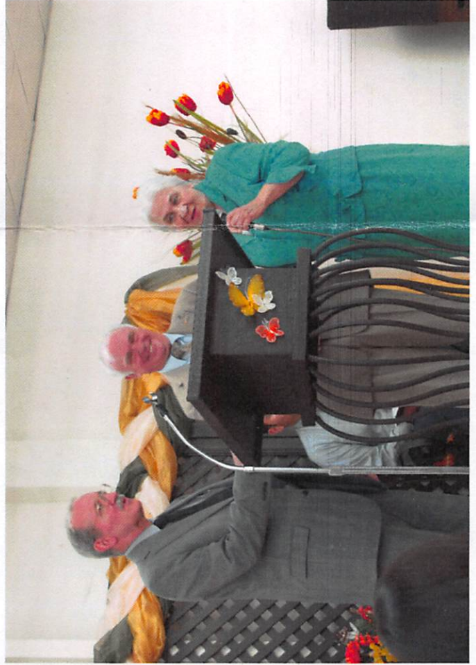
Giving our testimony