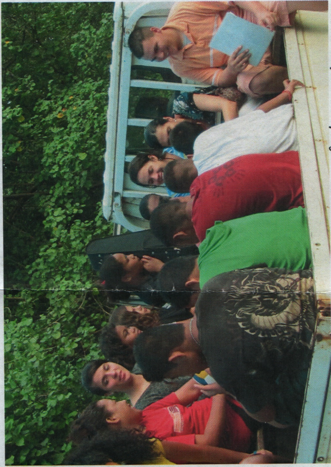
Yap Baptist SS diesel truck