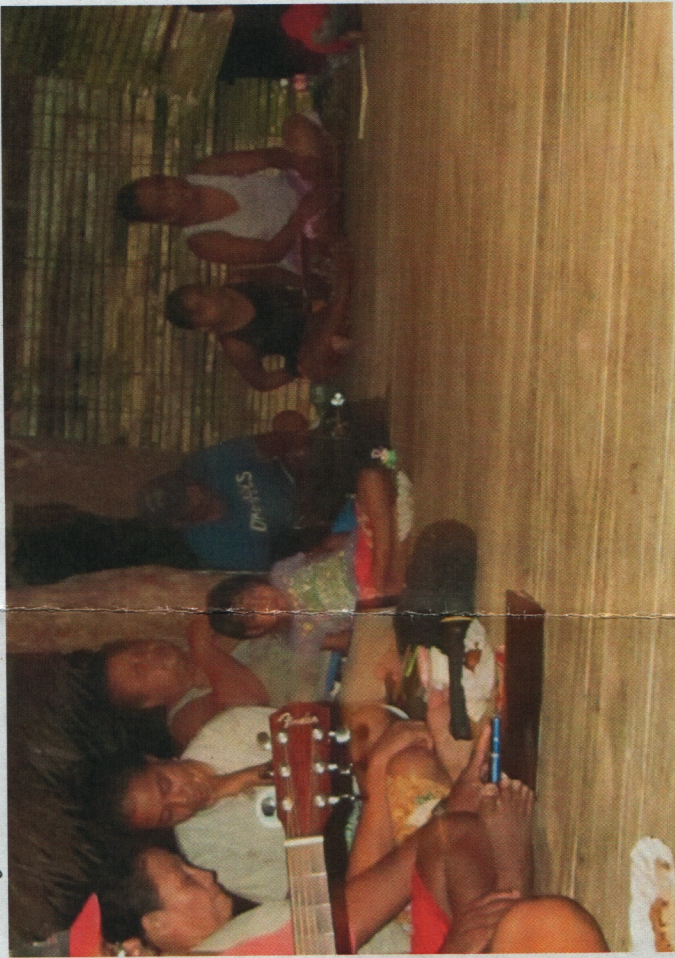
Maep Bible Study