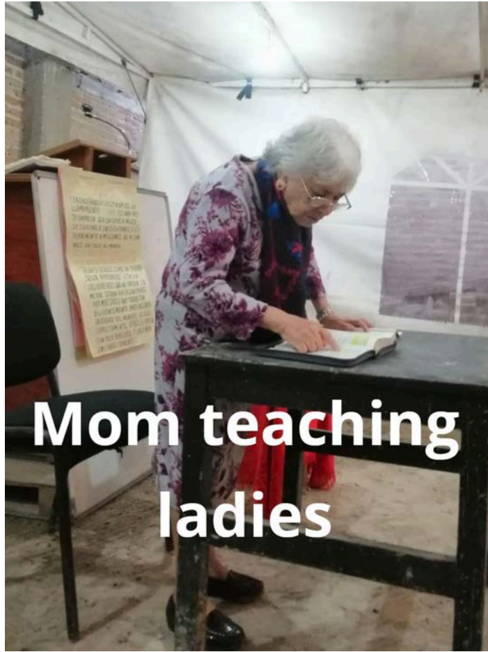
Mom teaching ladies