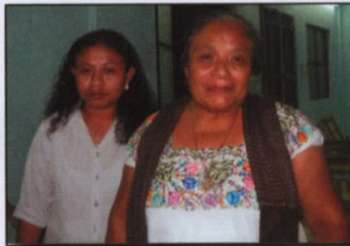
Mother of one of our students