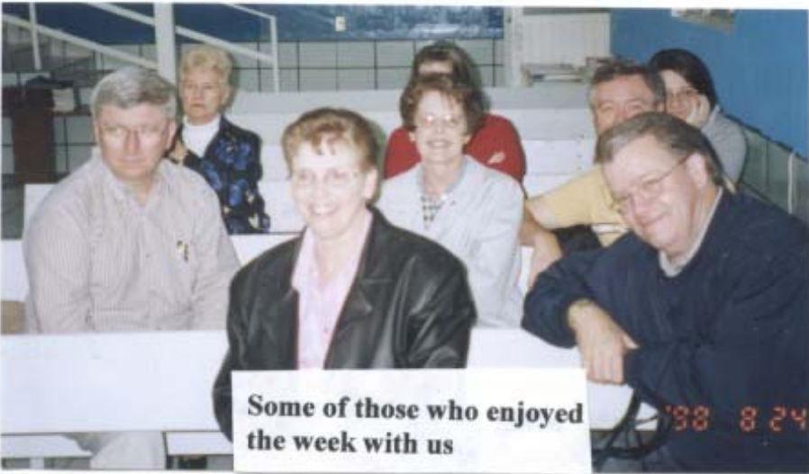
Some of those who enjoyed the week with us

NEXT YEARS CONFERENCE WILL BE HELD IN CANCUN THE THIRD WEEK IN JANUARY