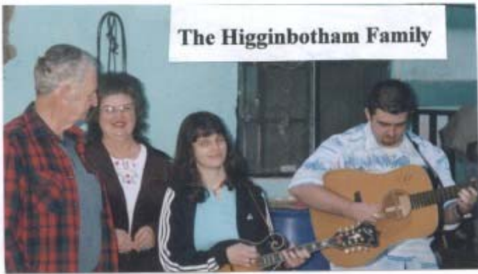
The Higginbotham Family