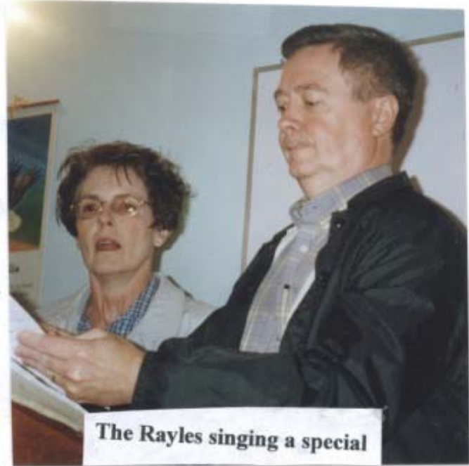
The Rayles singing a special