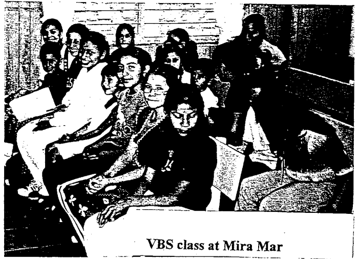
VBS class at Mira Mar