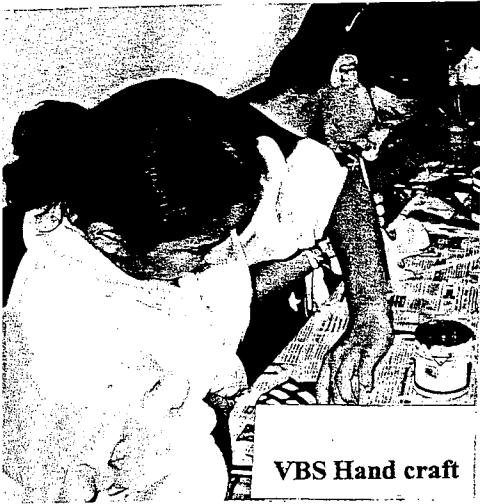
VBS Hand craft