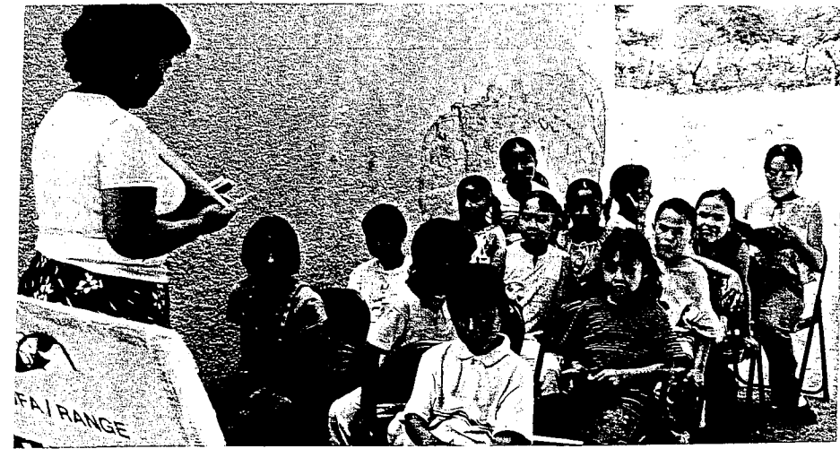
VBS at Los Pocitos