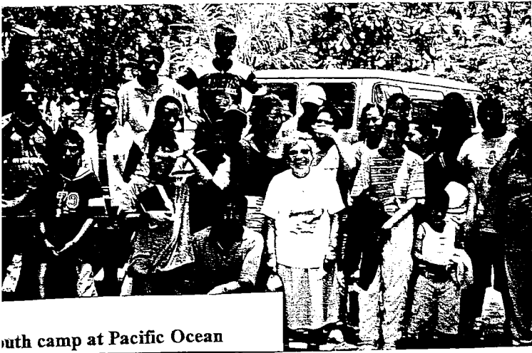
outh camp at Pacific Ocean