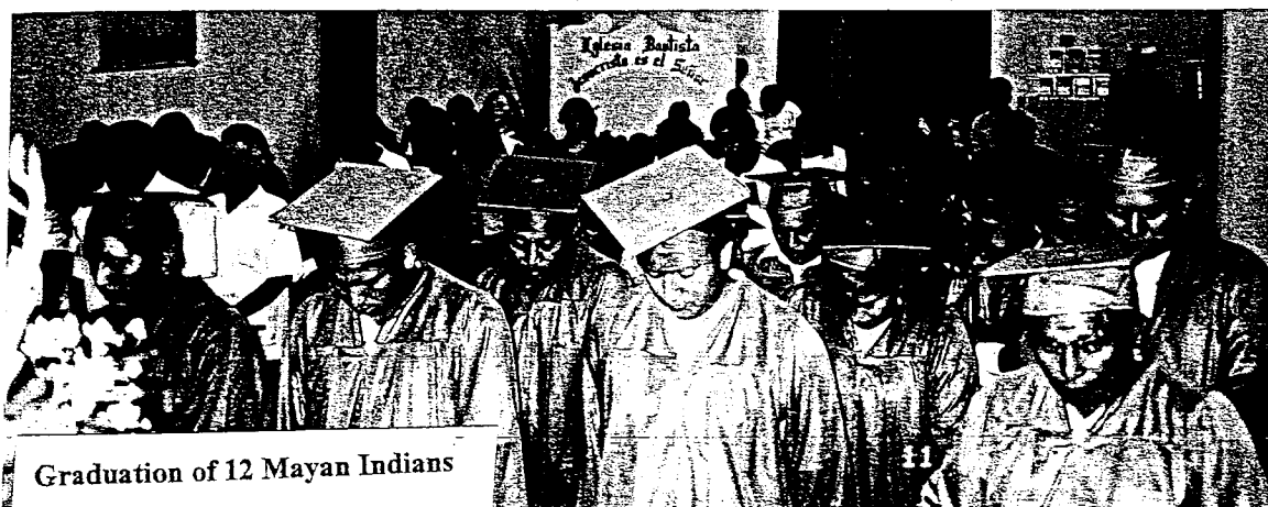
Graduation of 12 Mayan Indians