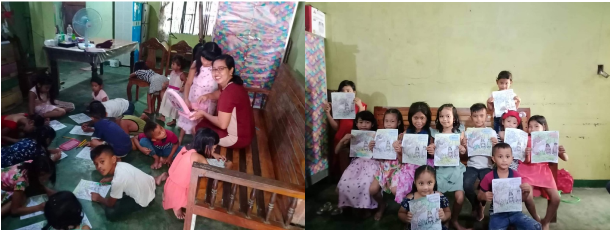
This is their Sunday school classroom. It is also their landlord's living room during the week.