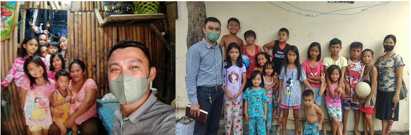
The Bible studies with these families are growing to where there will be a Bible believing Baptist Church planted soon!