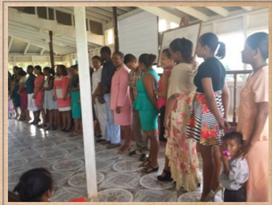
Teacher Appreciation Day, also approached the 250 mark for attendance