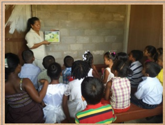
Miss Menas class 6 and 7 year olds