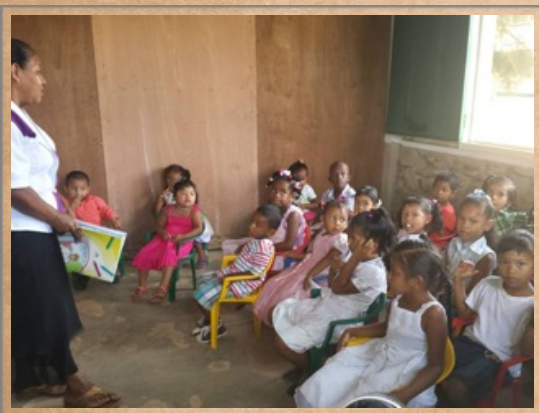
Miss Gemmas 4 and 5 year old class