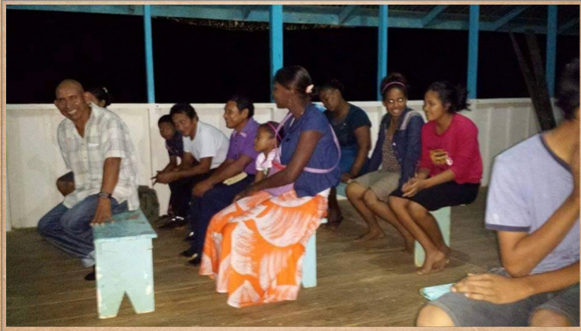
Lighthouse Baptist Church in the village of 4 Mile, Guyana