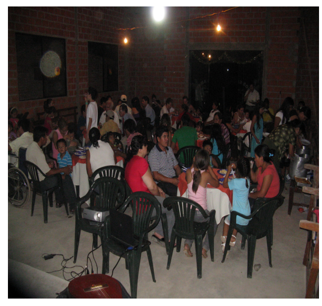
Building is completely filled in with doors and windows.