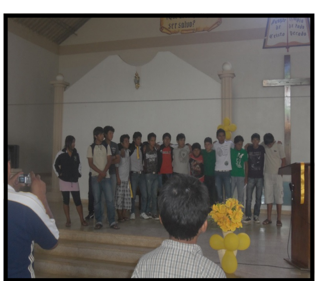
Kids that were saved