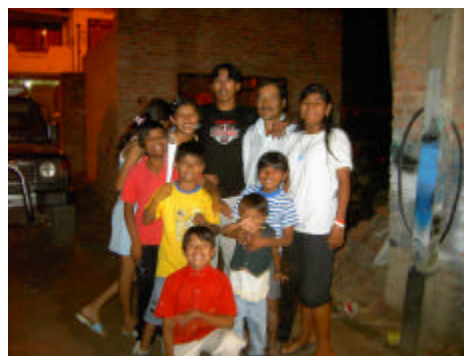
A group from the Toronjal Mission