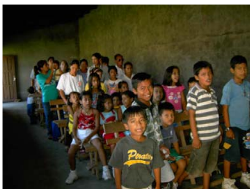
Group at 27 May Mission