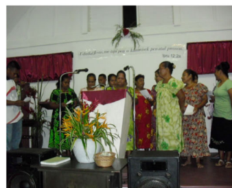
Choir singing praises