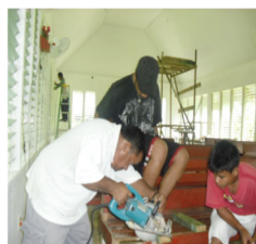
Our boys helping the Elder man cut wood for the pews.