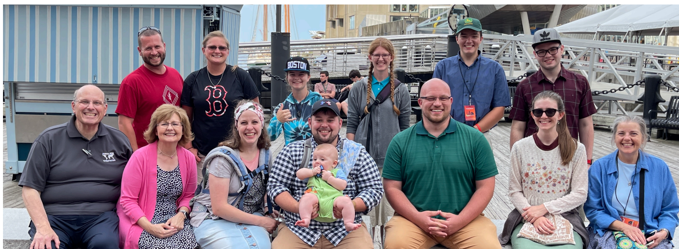
The See The Harvest Team

The See The Harvest team met one-to-one with pastors in the area. Over a dozen pastors met with our team and told them of the need in the northeast. I am praying God will use this trip for the sake of the Gospel and His name's sake so that more laborers will submit to His call.