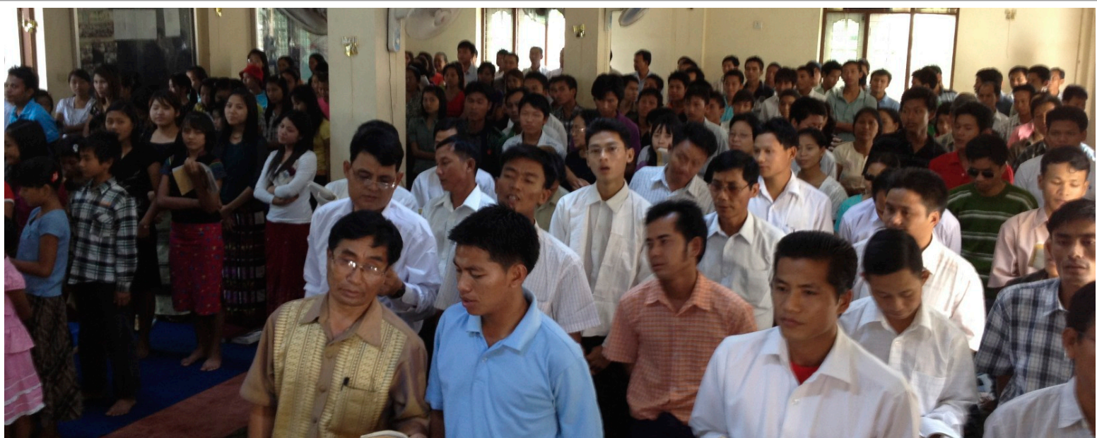
Top: Classes with Students and Pastors. Center Left: Banner for Thanksgiving Service. Center Right: Church Service fourth floor walkup Church Bottom: Pastors and Students in a Church Service.