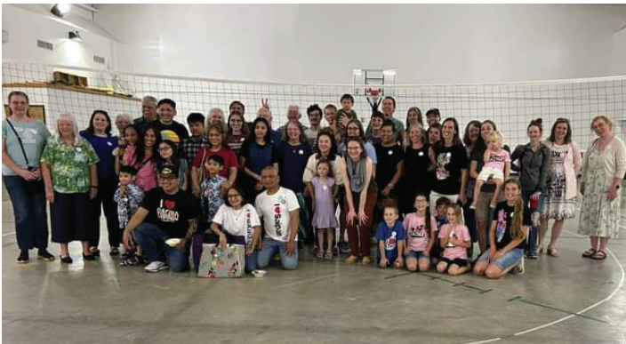
Group photo of many who attended the Saiapan Reunion