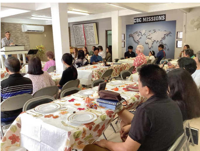
“Here we are listening to a Thanksgiving message right before eating a wonderful Thanksgiving meal.” The message was timely, the food was great, and the fellowship was so very precious.”