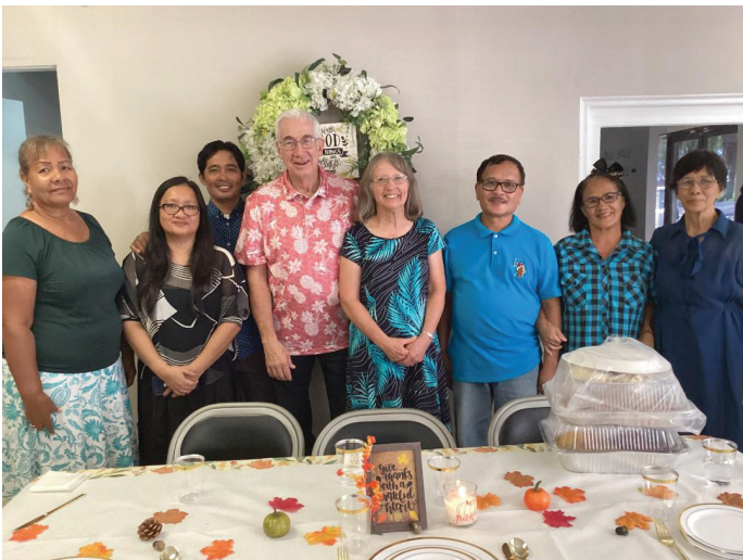
“Above are some of the members of Calvary Baptist Church in Saipan to whom we ministered for so many years. What a joy to be with them again and to see that they have remained faithful in their walk with God!!”