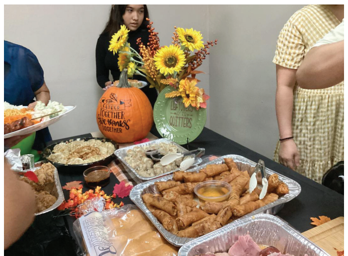
“Just some of the many island dishes that made up a fantastic Thanksgiving meal.”