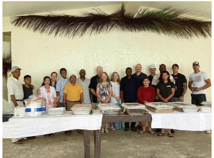
“Above are some members of Calvary Baptist Church here in Tinian posing with some of the additional soldiers that joined us for a delicious meal after church.”