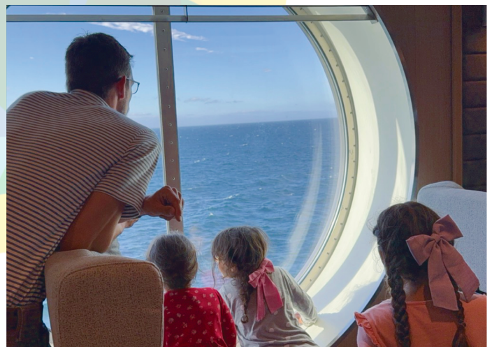
The ferry ride was exciting! First time on the ocean out of sight of land. Our short nautical experience brought to my mind the hymn the Haven of Rest. Praise the Lord for the stability and peace that He gives to those who trust in Him!