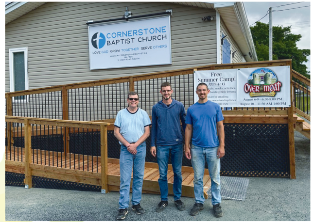
Greatly enjoyed helping my brother put some finishing touches on an entrance ramp at church.