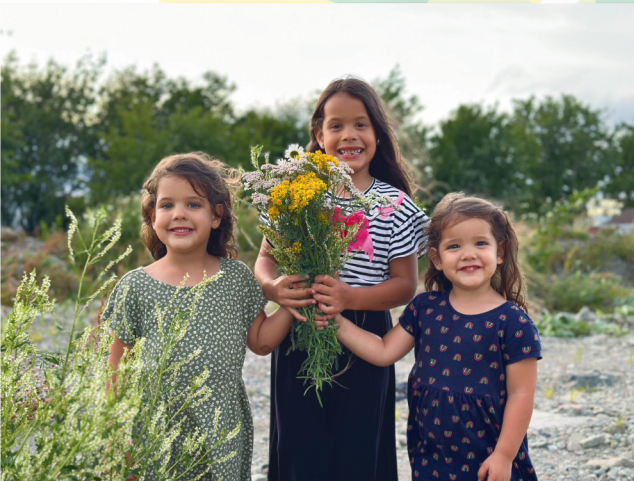
Harvesting some wildflowers in Nova Scotia.