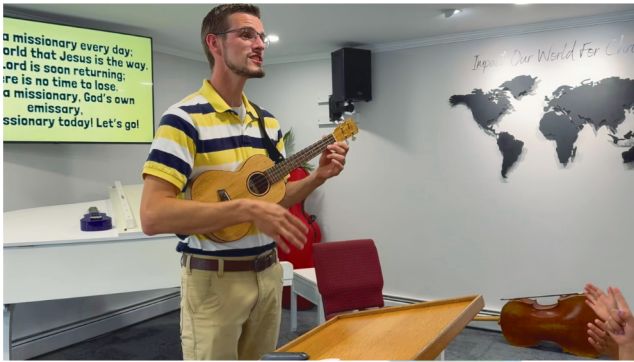
Leading songs in kids club with a borrowed ukulele.