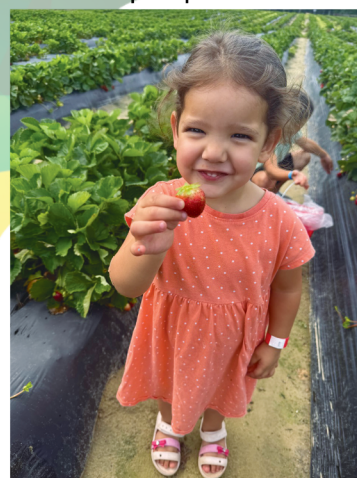
Enjoying the zoo and the strawberry farm.