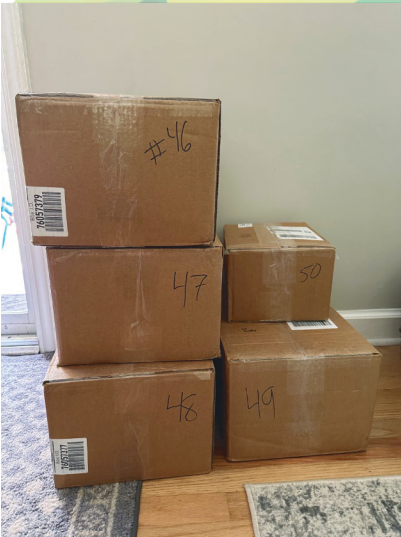
The packing continues whenever we are home.