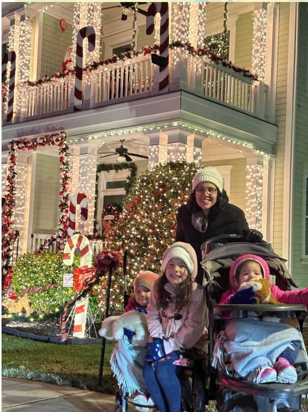
Enjoying Christmas lights!