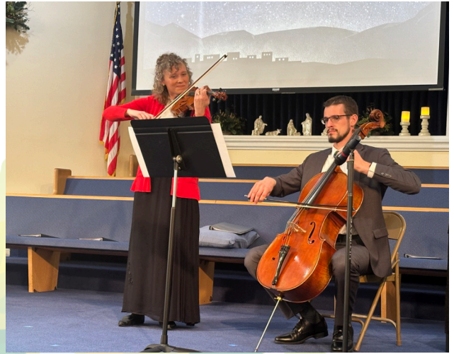
Playing a duet in church.