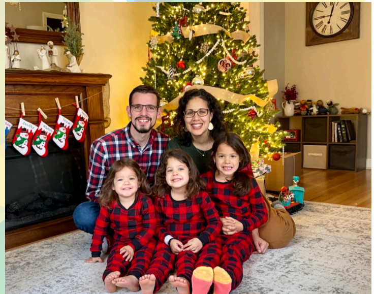
It was wonderful to spend Christmas at home.