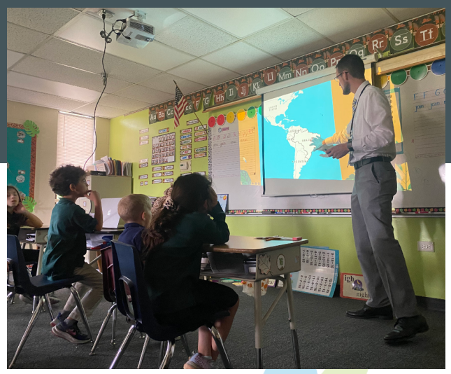
Telling school children about Brazil and missions.