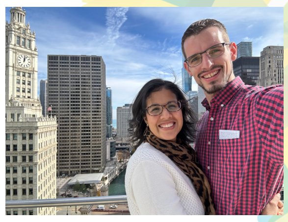
A church took us on a lovely tour of Chicago.