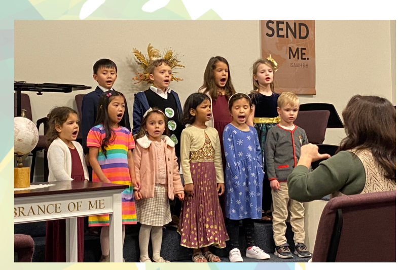
The girls enjoyed singing in a children's choir at a conference.