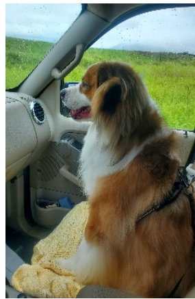
My Island Companion