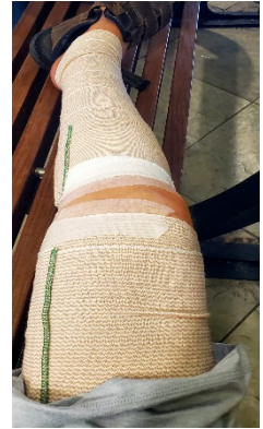
my leg surgery