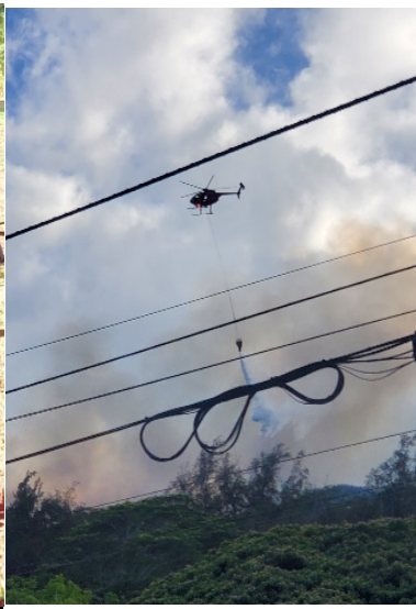
Fire across from our home