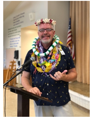
Typical island celebration

We have others in church that have made a profession of faith, but need to follow the Lord in believer's baptism. Please pray that they will step out by faith and make that commitment.