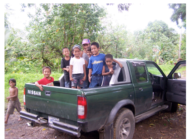
New bus route in Pehleng