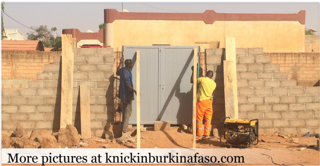
More pictures at knickinburkinafaso.com