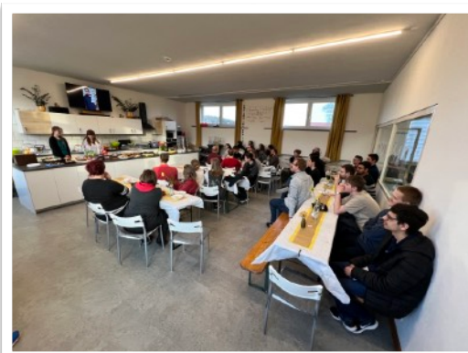
JET Day at our church