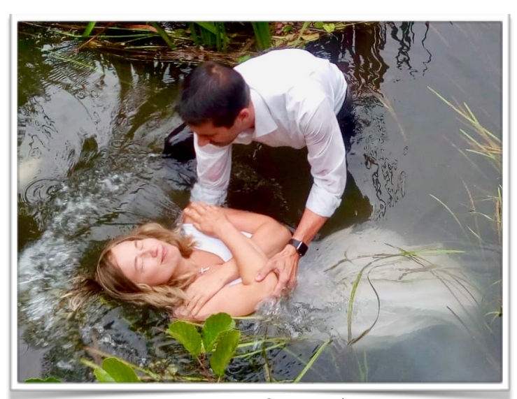
Baptism in September

Christ. September was also a time of rejoicing as we baptized a young couple. I had mentioned in a previous letter that I was able to lead the husband to the Lord this past spring. It is a blessing to see them growing and flourishing in their walk with the Lord! We also participated in a large evangelistic outreach in Neumarkt with a sister church. It is exciting to see what the Lord is doing in Bavaria. The first Sunday in October is our German Thanksgiving, and we were able to spend some time ministering at the local nursing