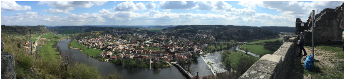
View from the castle ruins in Kallmünz.