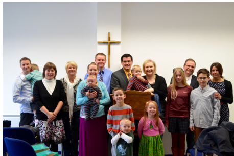
Opening night of youth retreat.

We also were privileged to host the Bavarian Youth Retreat in March, and were thankful to have around 50 teens and workers come share the weekend with us. Our theme for the weekend was "Faith is the Victory".