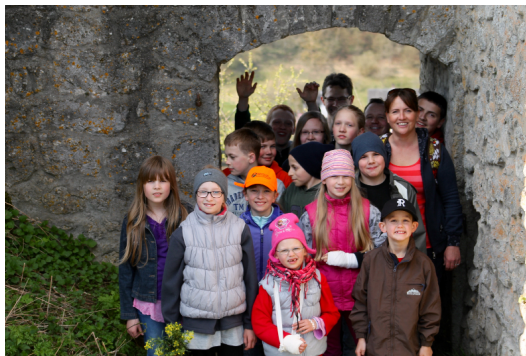
Combined teen/kids activity at the castle in Kallmünz, Germany.