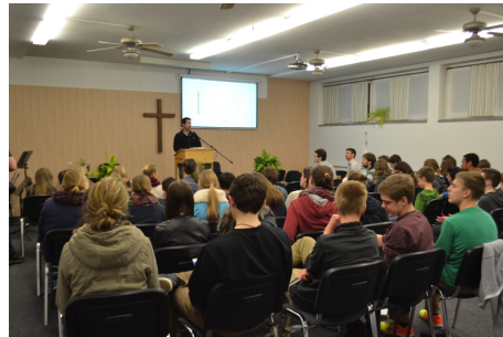
First service at the Freie Baptisten-Gemeinde, Neutraubling.