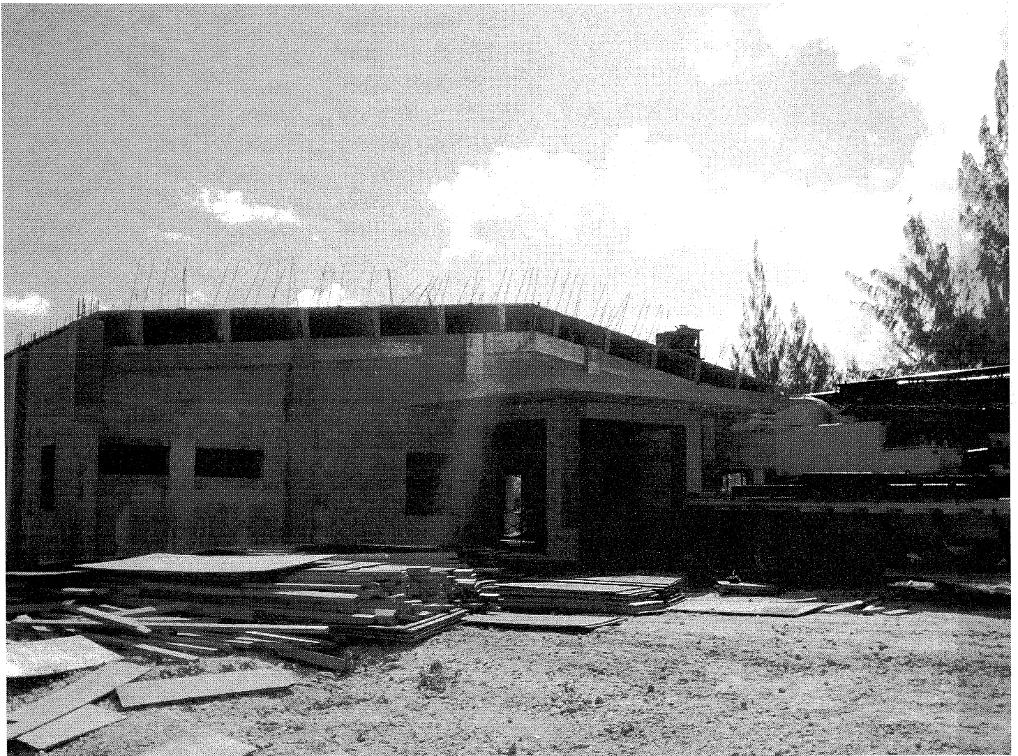
View of entrance of building with roof