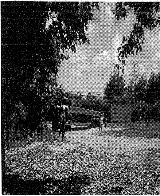
Roofing panes arriving