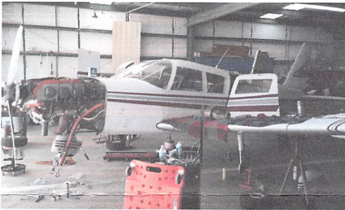
Annual Inspection Time