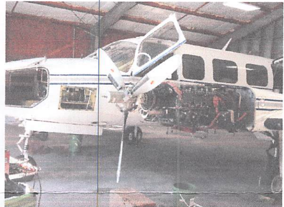
Mission Air Care's Piper Chieftain