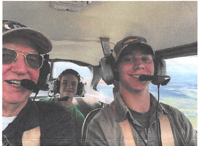
Bro Jack with 2 "Happy Flight Campers"