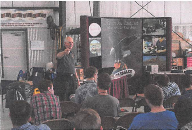
Missions Classes were special !