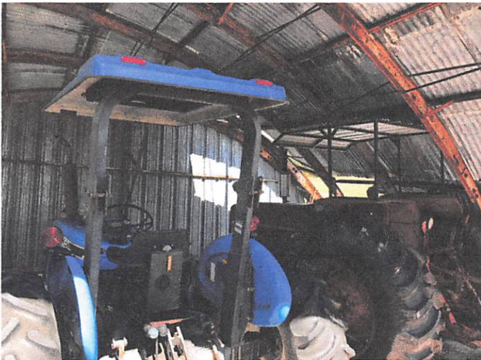
Tractors safe inside by God's Grace!