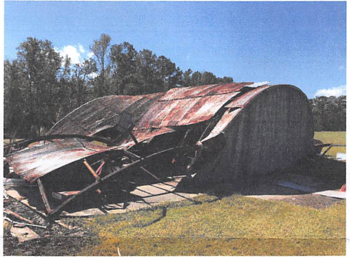
Front Quartering View – It Went Down L to R