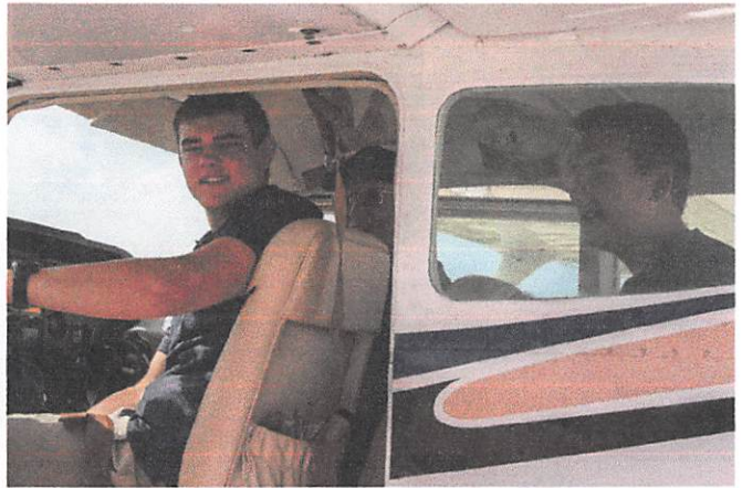
"Saddled Up" with one flying, one riding