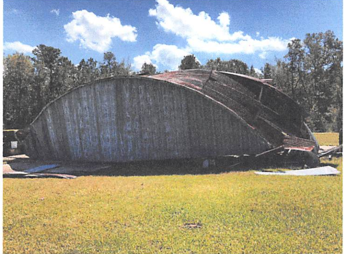
Front head-on view