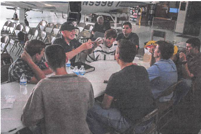
Lunch time in the hangar