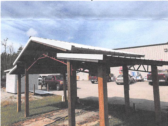
Sample of Components – Pole Shed