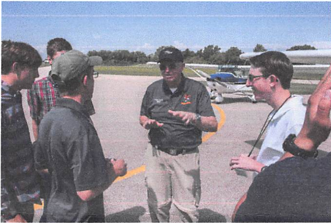
Teaching Aerodynamics before flight