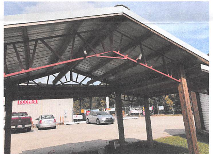
We Will Need to Get One!