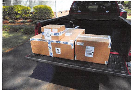
New Components for Flight Simulator