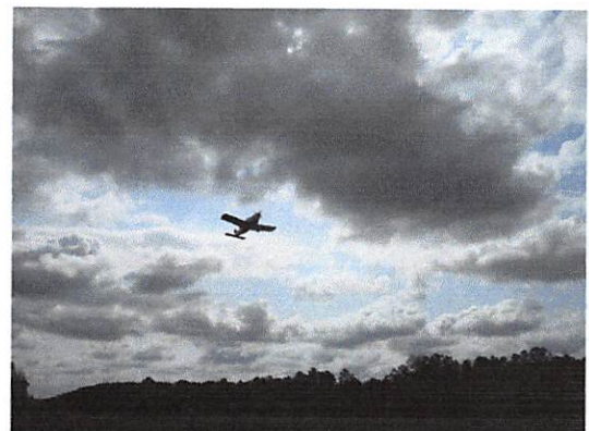
Out to pick up Bro Byron Foxx - BTM