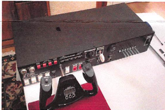
Our Broken Flight Simulator