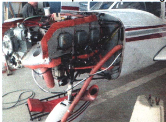
In the hangar for a bit of TLC!