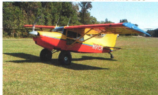
Bro Les Zerbe arrives with the Maule