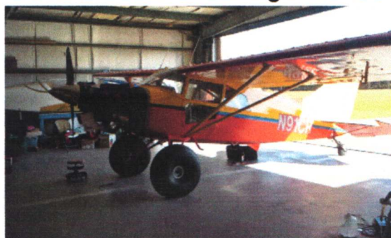
Time for some repairs, mods, oil change